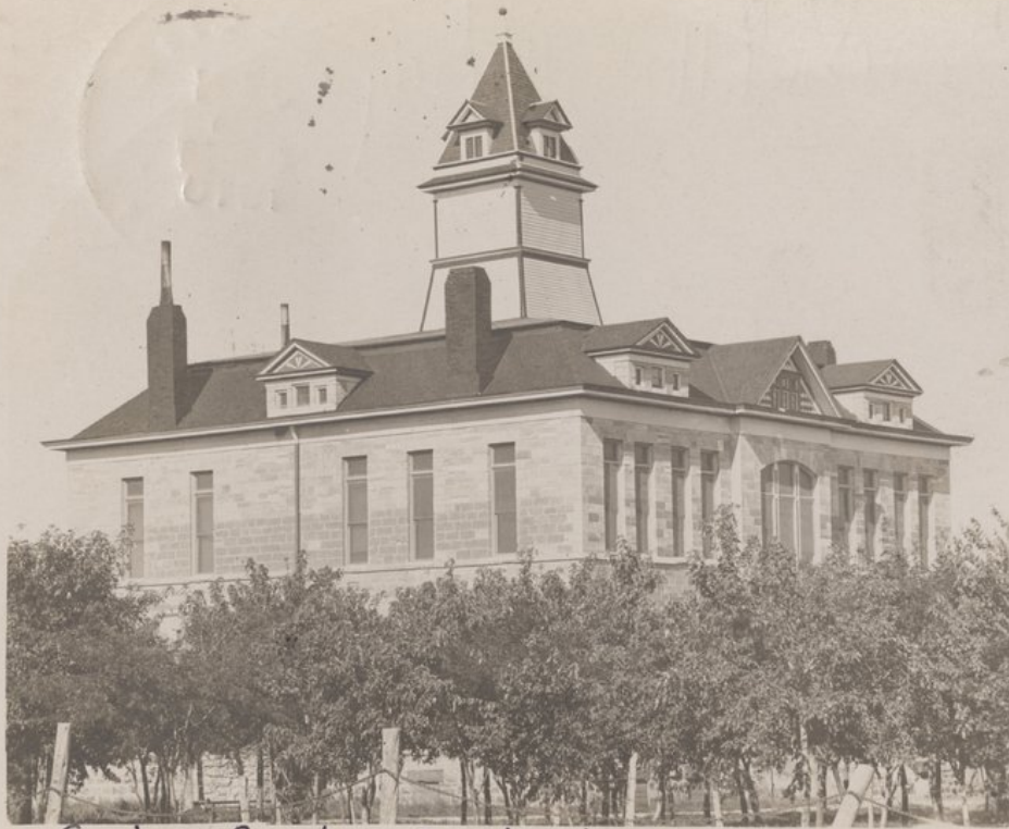
Graham County Court House