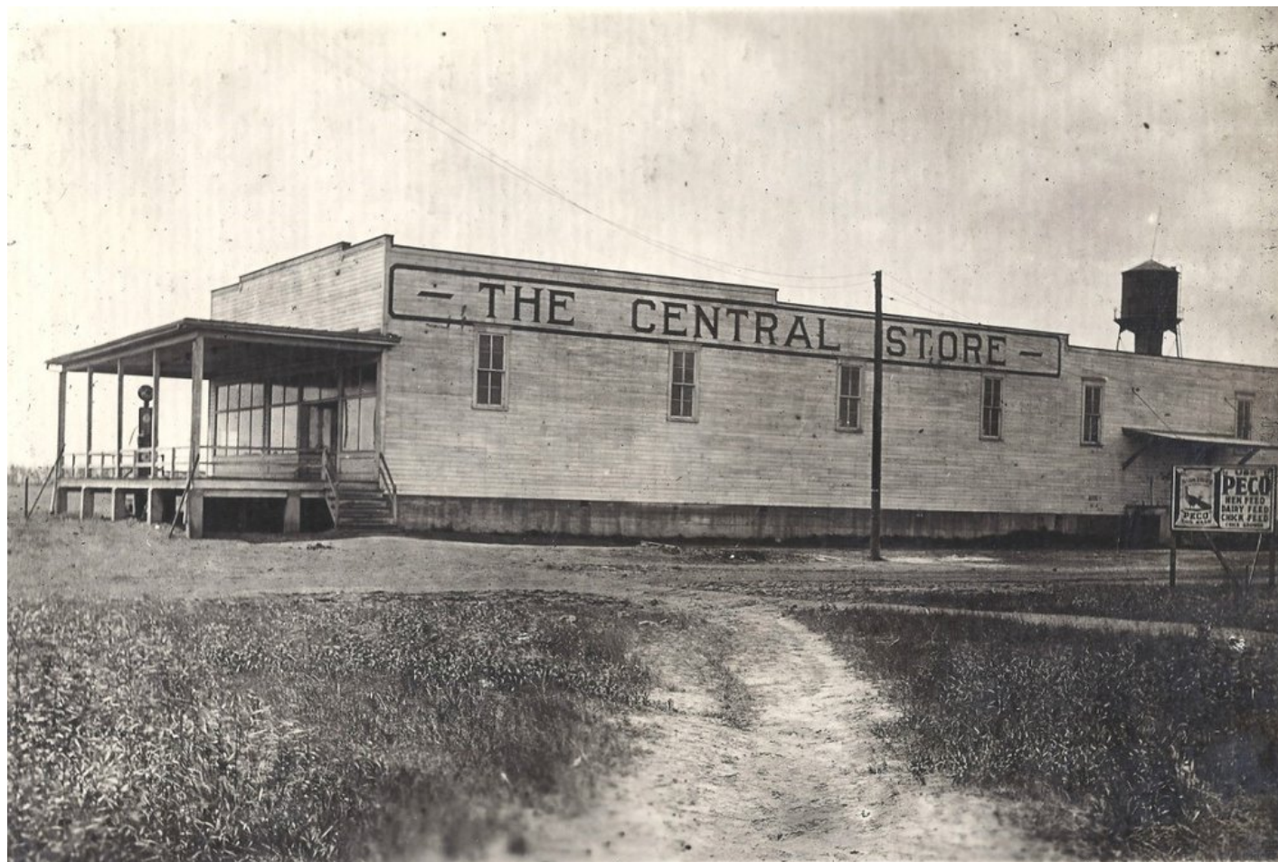
store and water tower