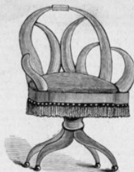
BUCKHORN CHAIR PRESENTED TO THE PRESIDENT.