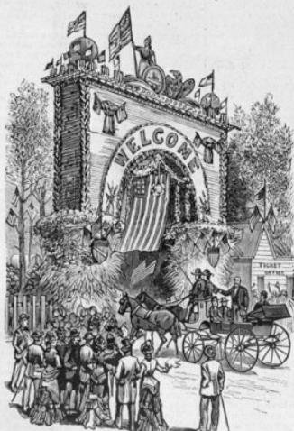
SYMBOLIC ARCH AT THE ENTRANCE TO THE FAIR-GROUNDS.

headed by the band of the United States infantry and a company of boys, less than twelve years old, in the uniform of Zouaves, followed by a procession of carriages and civilians a mile long. The grounds were handsomely decorated and ornamented by various productions of the State, artistically and tastefully arranged. At the entrance was a magnificent arch of welcome, formed entirely of agricultural products and bearing the Goddess of Liberty. The reverse side bore the