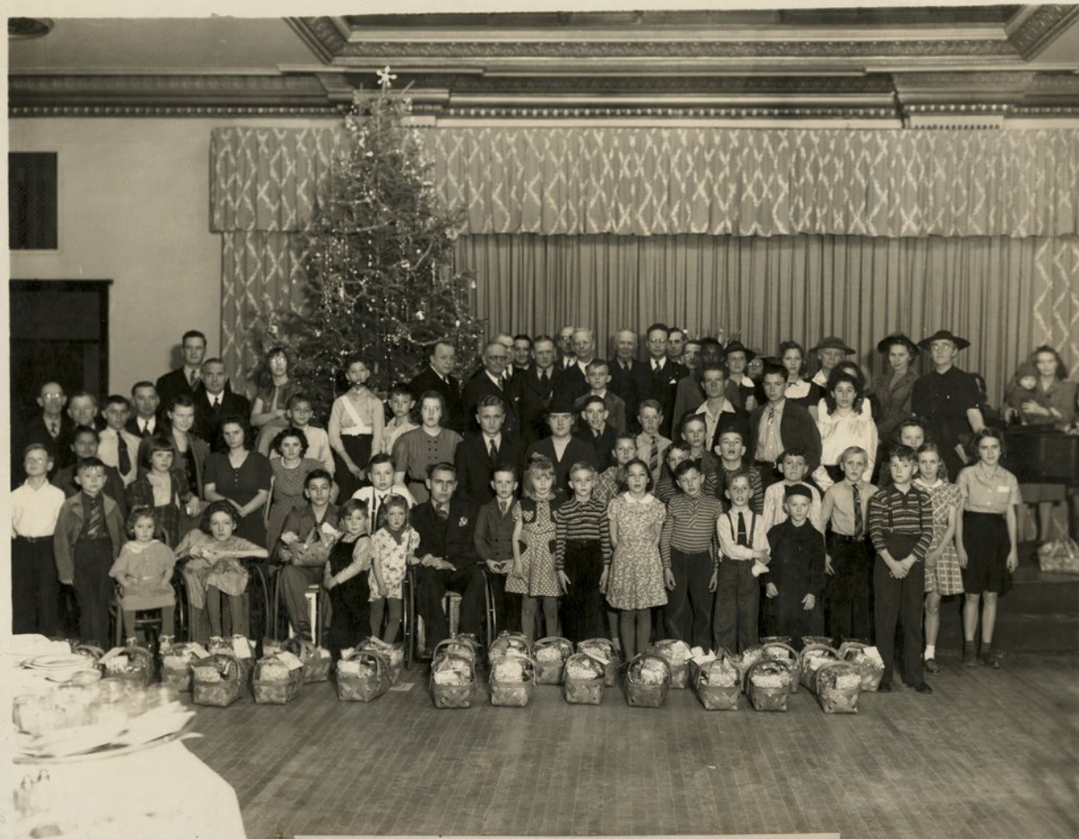
Twelfth Annual Rotary Crippled Children Party Broadview Hotel, Emporia, Kansas December 16, 1941