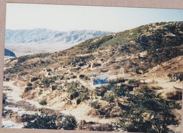
Charlie Battery "Sandbag City"