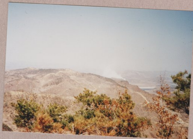
Looking out from OP#2 towards Hill "Nori" which passes back & forth