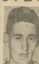
Ted Williams Red Sox