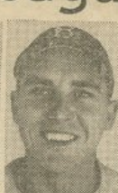
Gil Hodges Dodgers