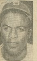
Jack Robinson Dodgers