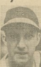
Stan Musial Cardinals