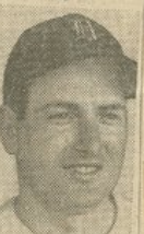
George Kell Tigers