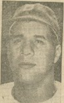
Roy Campanella Dodgers