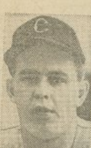
Nelson Fox White Sox