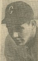
Chico Carrasquel White Sox