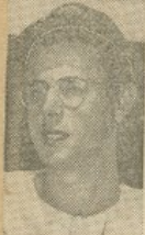
Dom DiMaggio Red Sox