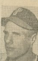
Richie Ashburn Phillies