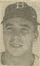
Pee Wee Reese Dodgers