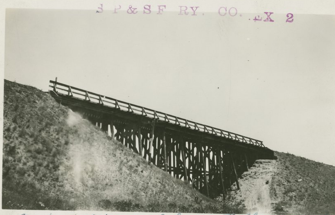
Br 40-A, 140' open deck pile trestle with walkway and handrails