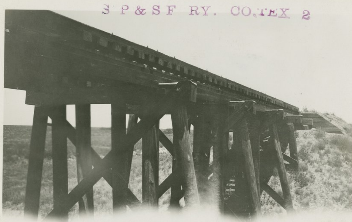
Typical pile trestle - Griggs 34-A