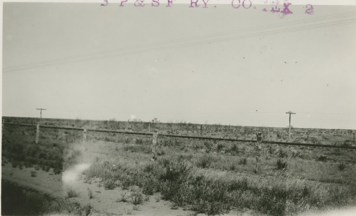
Typical view of undeveloped land. Scene near mile post 18