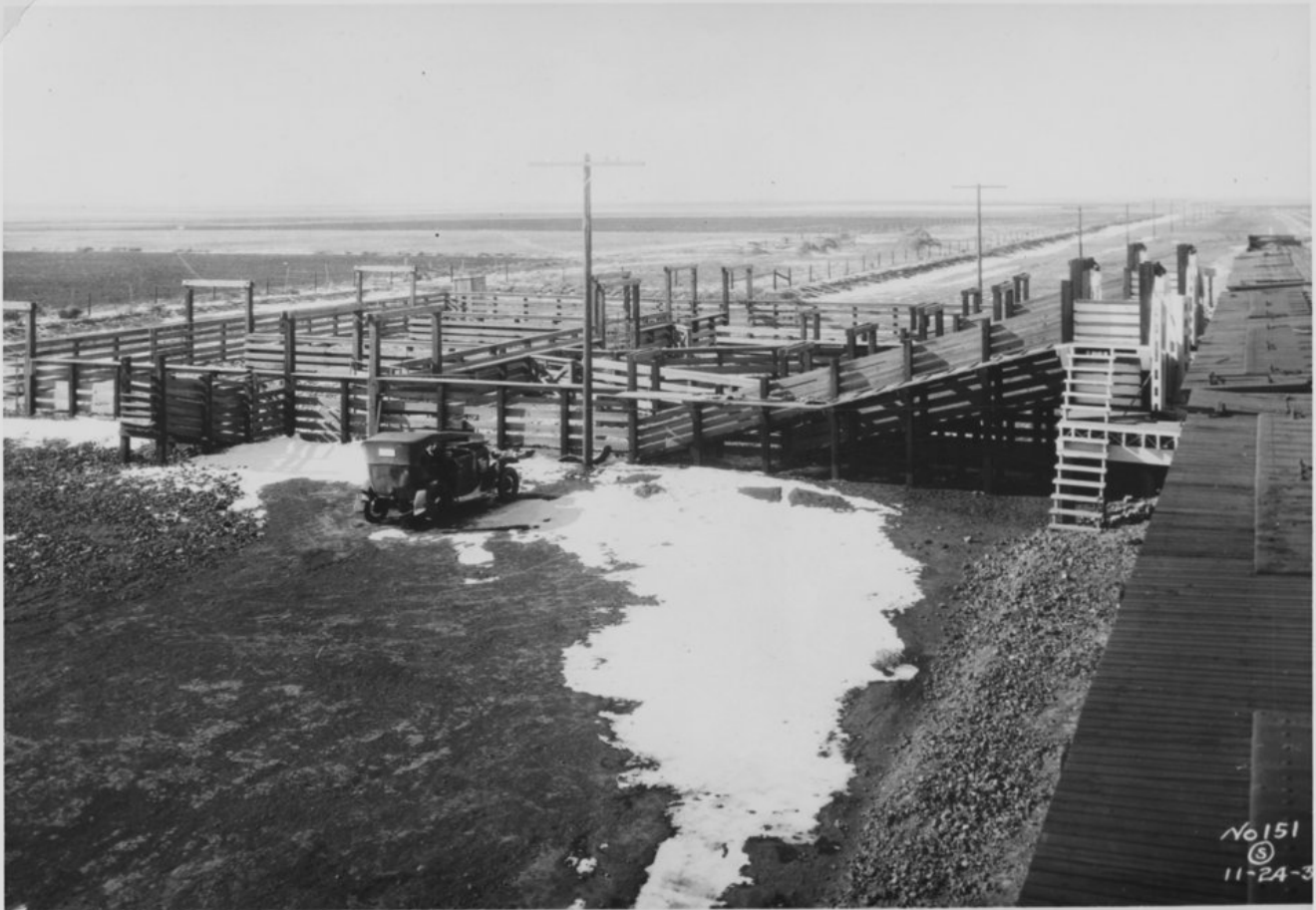
View of Sofia stock yards, same being 95'x107', 6 pens, 2 combination chutes, and truck unloading chute. Yards surfaced with 6" of volcanic cinders.