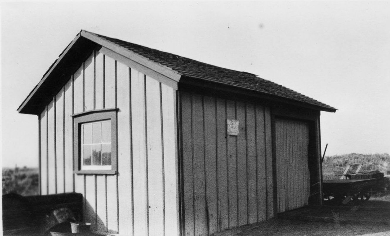
Englewood - V. S. Kans-38 - Tool House 12x16 (1887) 5-28-31