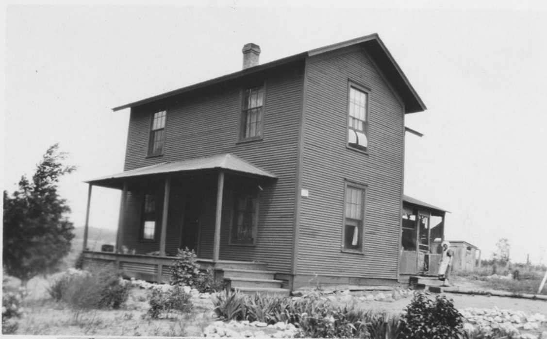
Rago - V. S. Kans-38 - Section House 16x28 (1884) moved from Murdock (1922) 5-28-31