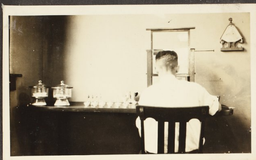
BALANCE. AN INSTRUMENT FOR WEIGHING.