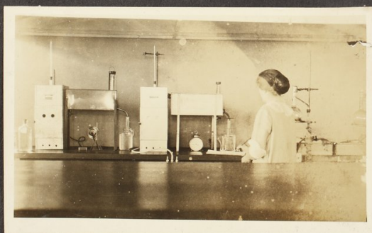
END POINT APPARATUS.