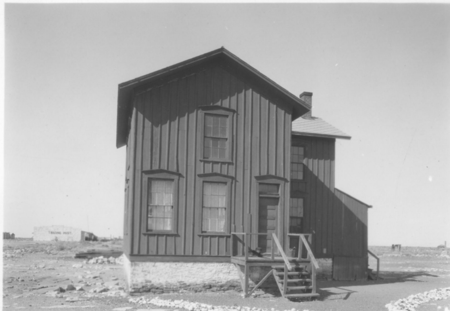
CANYON DIABLO SECTION HOUSE AT&SF Arizona 2 - June 11, 1931 Constructed 1882